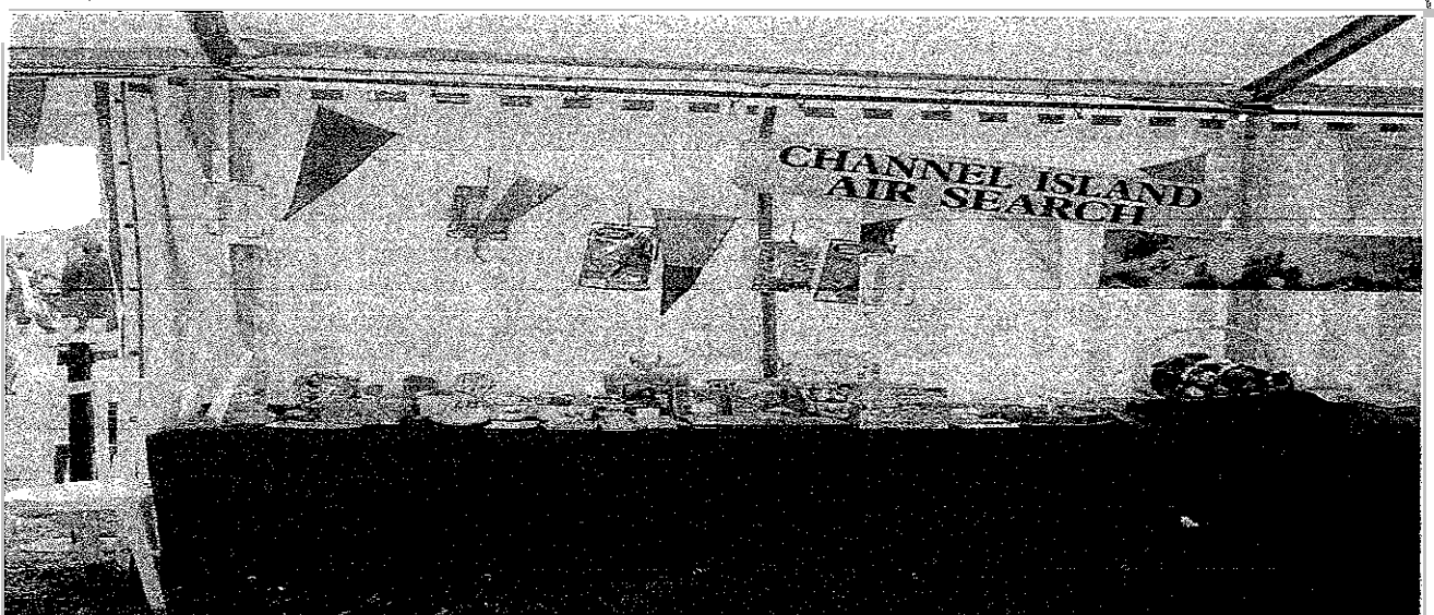
Sark Sea Festival - September 2006

In September we took part in the Sark Sea Festival, this was held in a field in the north the island. There was entertainment on all day and the Sark Hotels provided different types of seafood delights to purchase. The Friends of Air Search were given a pitch in the Main tent and had a great response from the Sark people and visitors who had travelled over to Sark for the day's events.